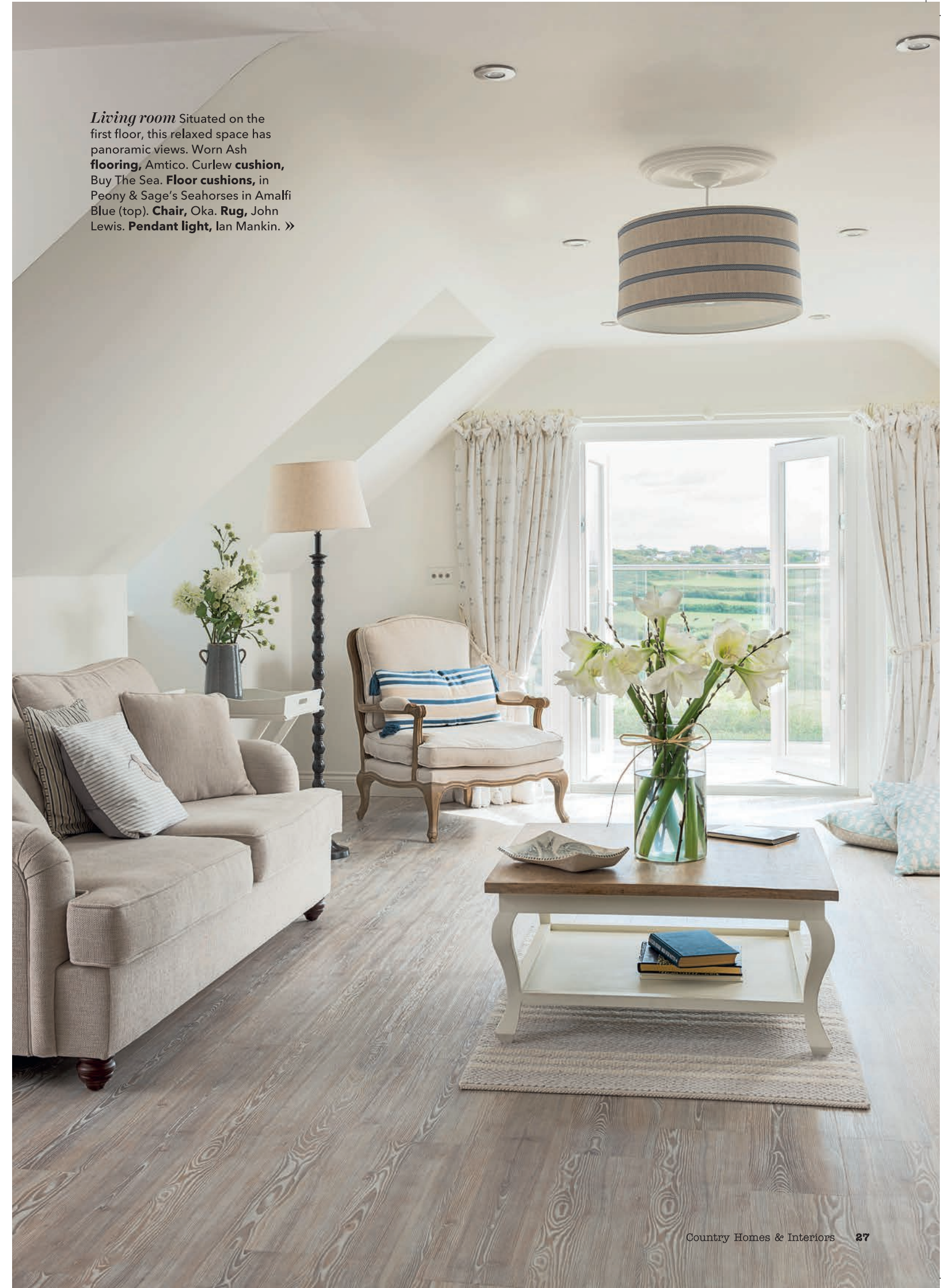
Living room Situated on the first floor, this relaxed space has panoramic views. Worn Ash flooring , Amtico. Curlew cushion , Buy The Sea. Floor cushions , in Peony & Sage’s Seahorses in Amalfi Blue (top). Chair , Oka. Rug , John Lewis. Pendant light , Ian Mankin. >>