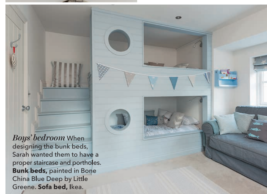
Boys' bedroom When designing the bunk beds, Sarah wanted them to have a proper staircase and portholes. Bunk beds , painted in Bone China Blue Deep by Little Greene. Sofa bed , Ikea.