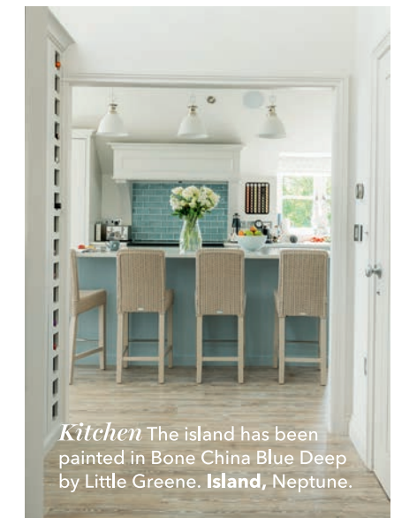
Kitchen The island has been painted in Bone China Blue Deep by Little Greene. Island , Neptune.

📞 Little Fish Escapes, visit littlefishescapes.com . For Sarah's interior design business, Little Fish At Home, visit littlefishathome.com . Alternatively, call 07979 861483. >>