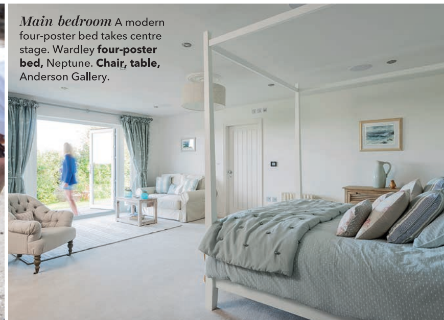
Main bedroom A modern four-poster bed takes centre stage. Wardley four-poster bed , Neptune. Chair, table , Anderson Gallery.