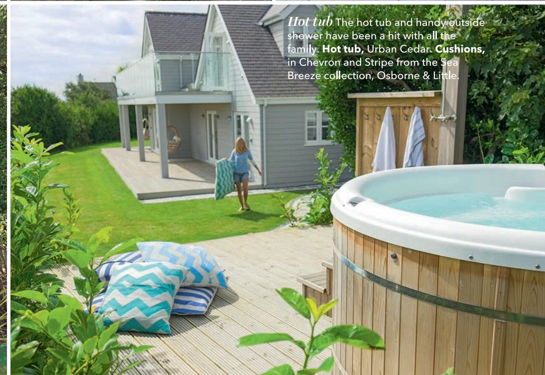
Hot tub The hot tub and handy outside shower have been a hit with all the family. Hot tub , Urban Cedar. Cushions , in Chevron and Stripe from the Sea Breeze collection, Osborne & Little.